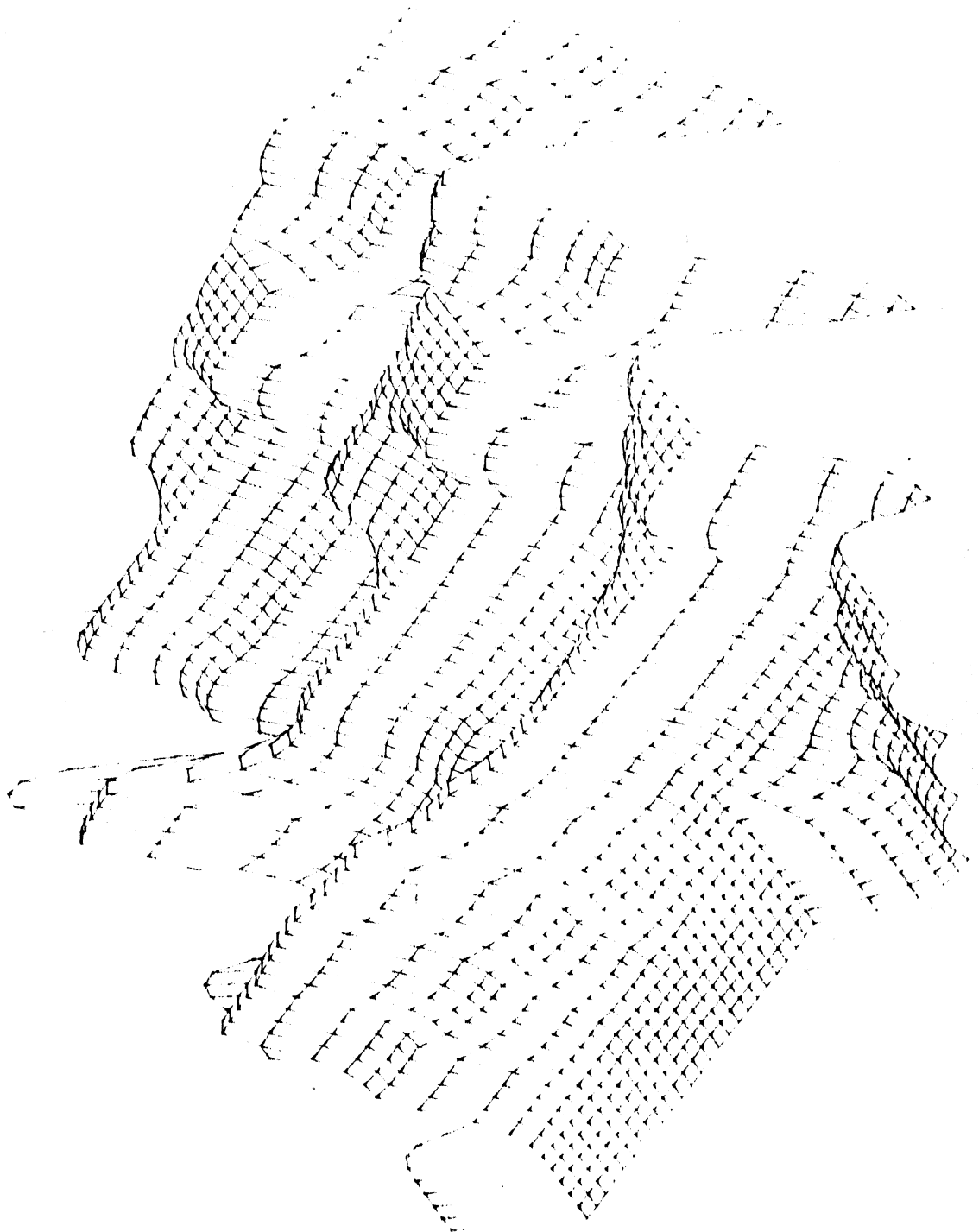
Fig. 4 - \beta_1 = 1000 ; \beta_2 = 10