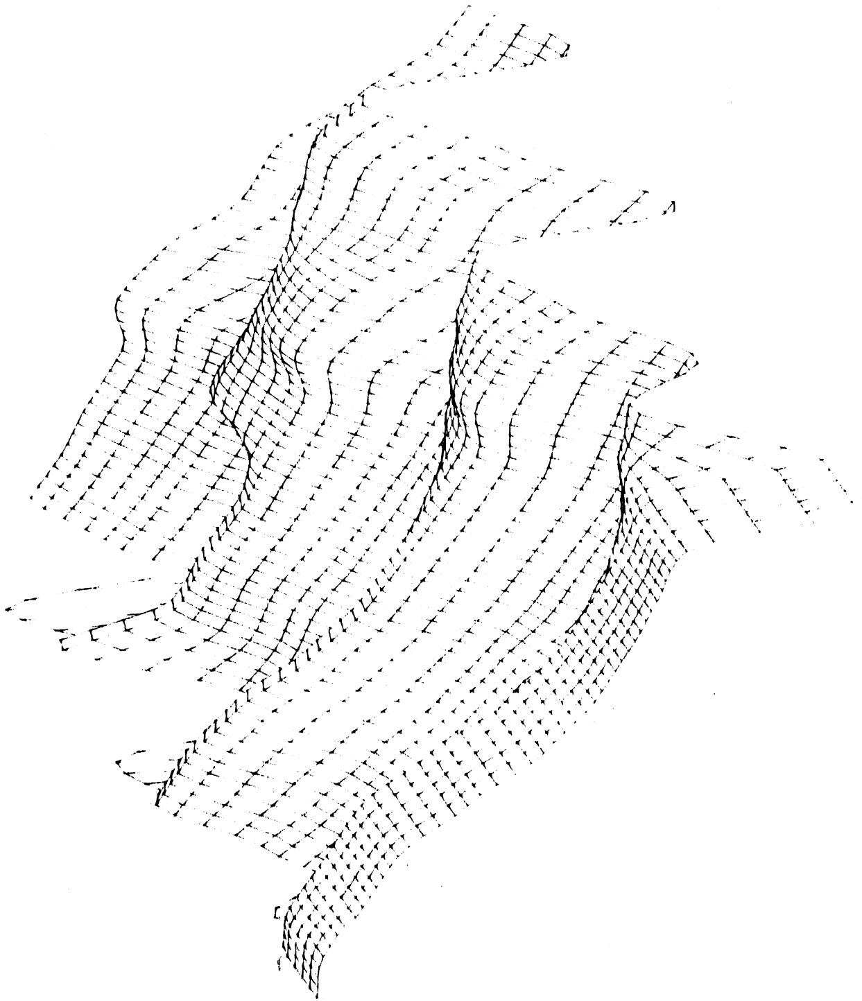
Fig. 3 - \beta_1 = 1 ; \beta_2 = 25