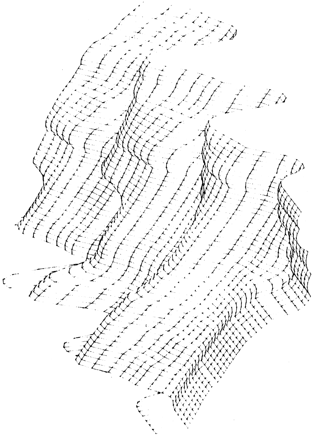
Fig. 2 - \beta_1 = 8 ; \beta_2 = \emptyset