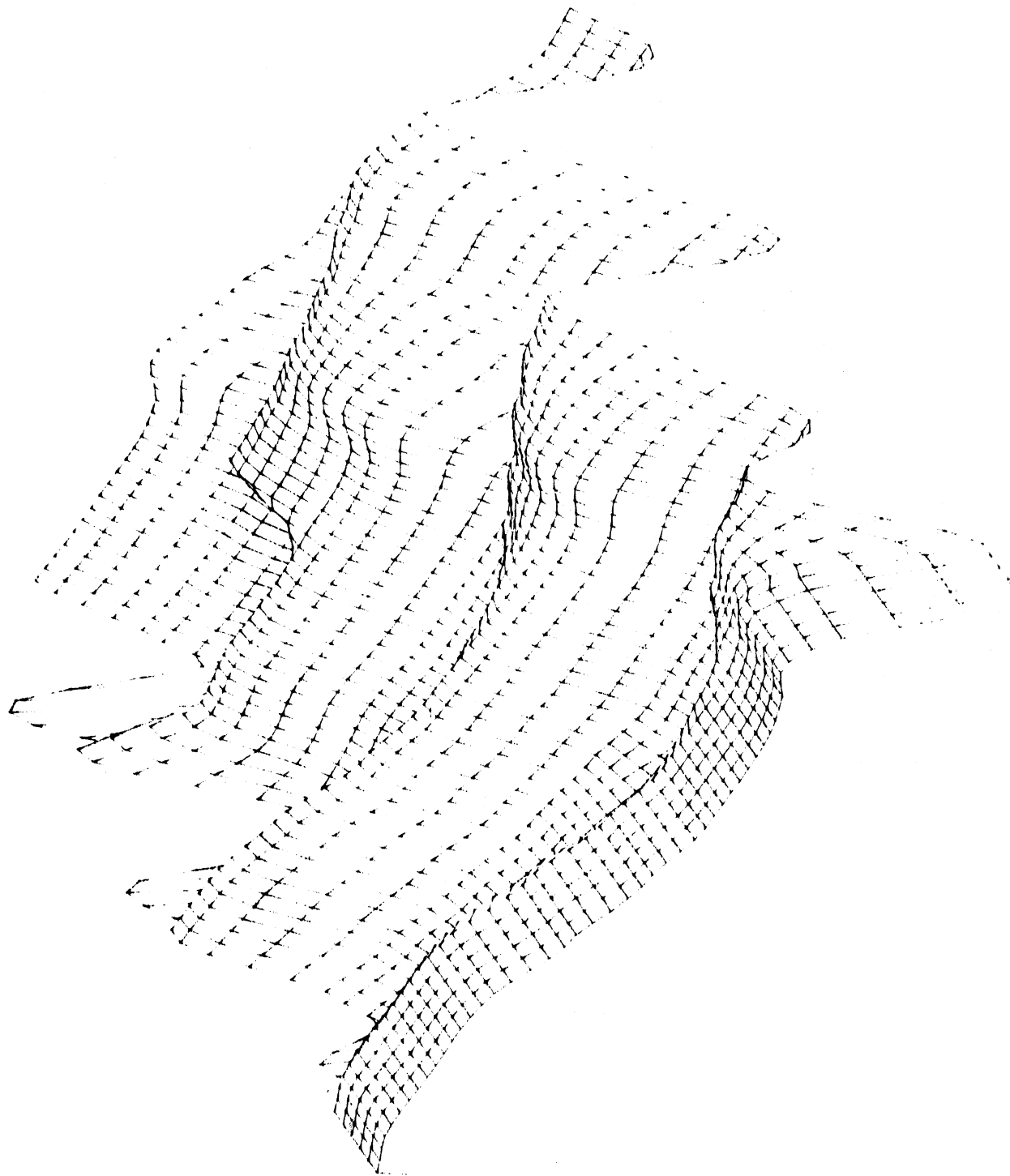
Fig. 6 - \beta_1 0.001 ; \beta_2 = 10